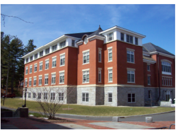
Amherst College Pratt Hall Amherst, MA

Harvard University , Cambridge, MA Jordan Hall Renovations Wolbach Hall Renovations